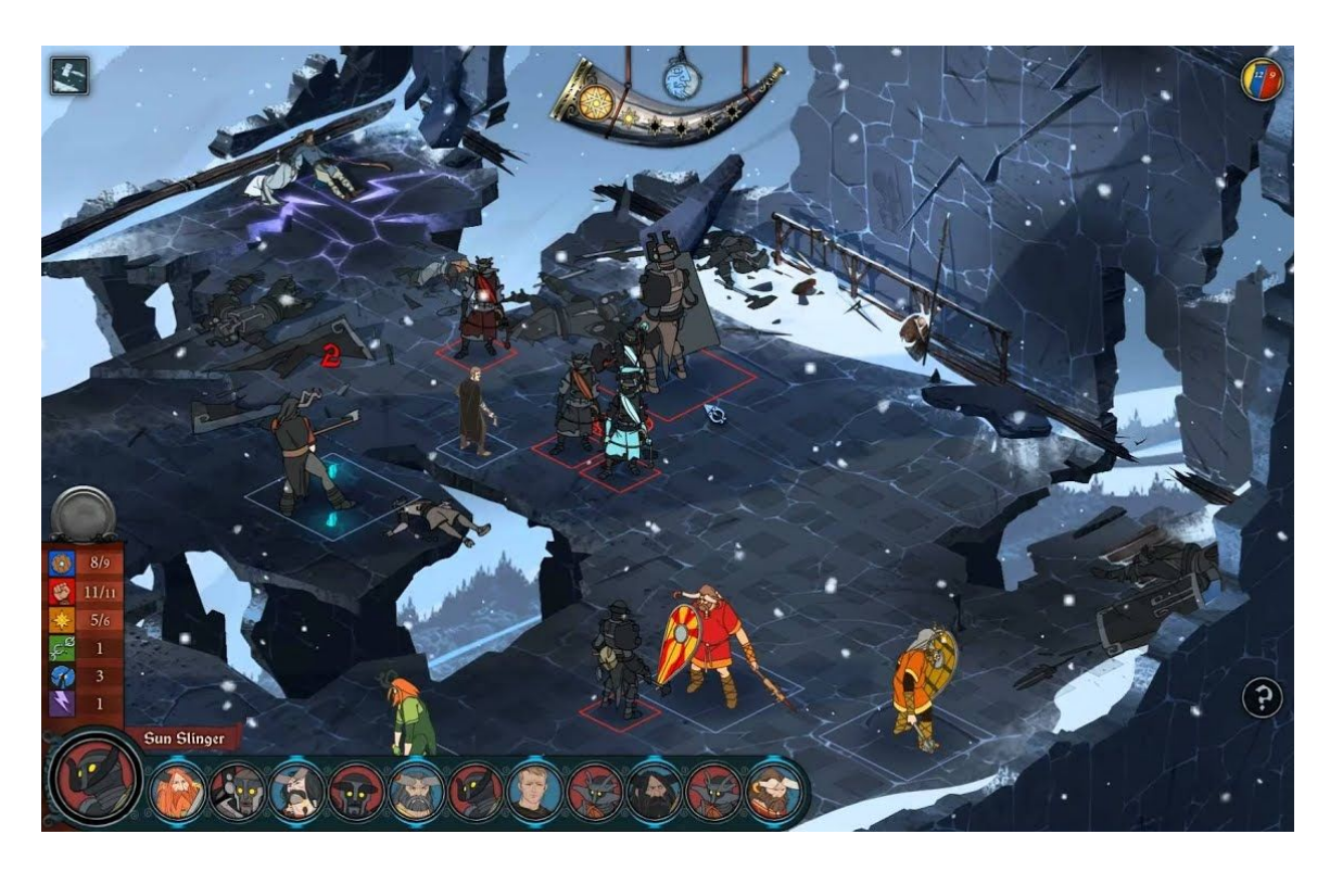
"The Banner Saga's elegant harmony of gameplay and narrative keeps the stakes of battle both relevant and engaging."

Cold-heartedness reaps as much trouble as reward. In The Banner Saga , there are no right choices, only priorities. The game constantly puts players into vulnerable positions that force them to make tough calls based on the statistical reality of their caravan's circumstances. It's sharp, mechanical-narrative commentary on just how difficult and burdensome leadership can be.