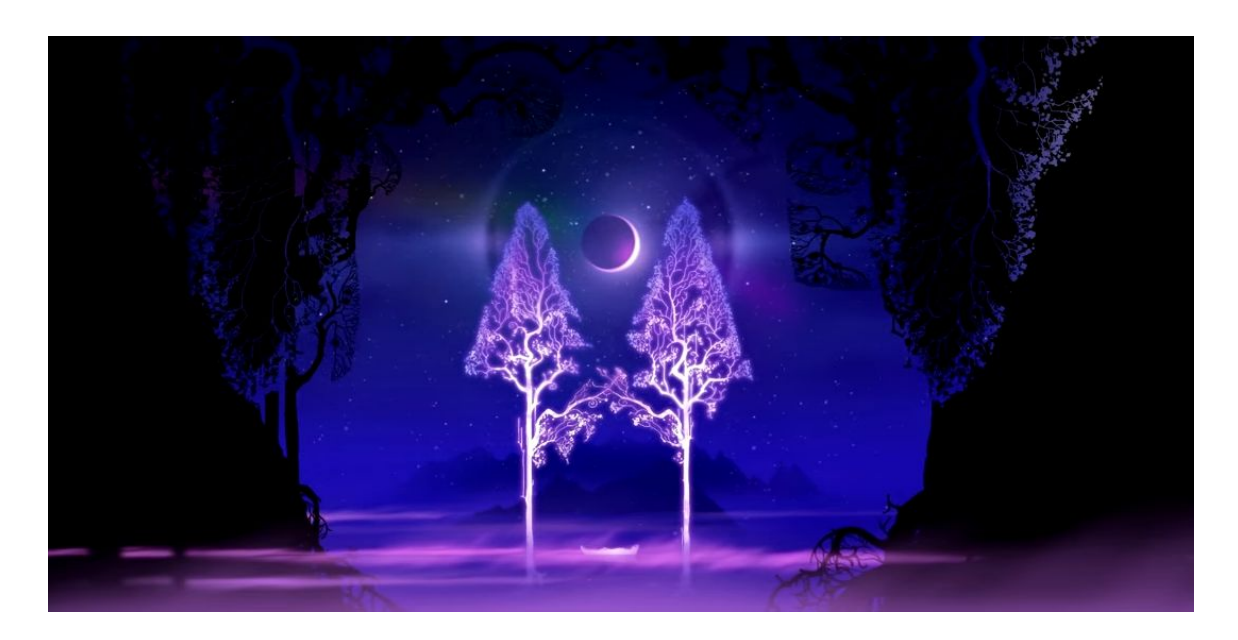
"Tonally, visually, and functionally, the ending of 'The Banner Saga' captures the essence of everything the game stands for"

Tonally, visually, and functionally, the ending of The Banner Saga captures the essence of everything the game stands for. Seeking to prove her worth, Alette asks her father to be tasked with shooting the golem commander, who has been chasing the caravan throughout the story. The player must choose whether to accept Alette's request or entrust this matter to Rook. Ultimately, whoever the player tasks with this mission is killed in battle, their sacrifice paving the way to victory.